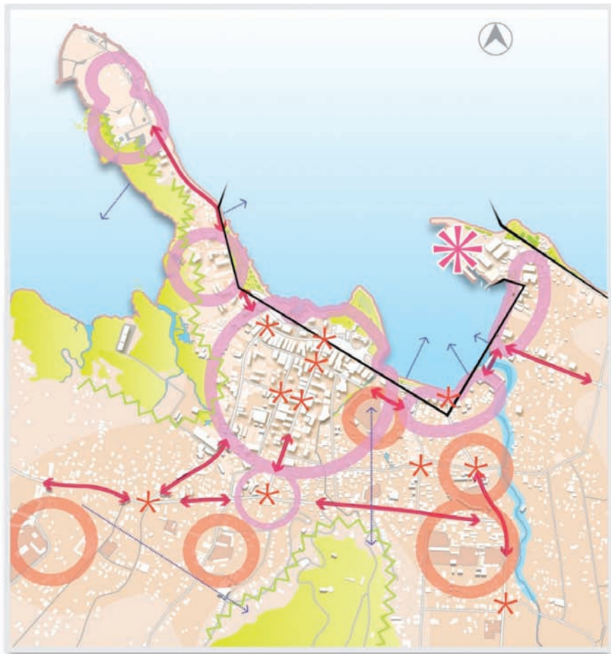
Figure 2: Spatial Analysis